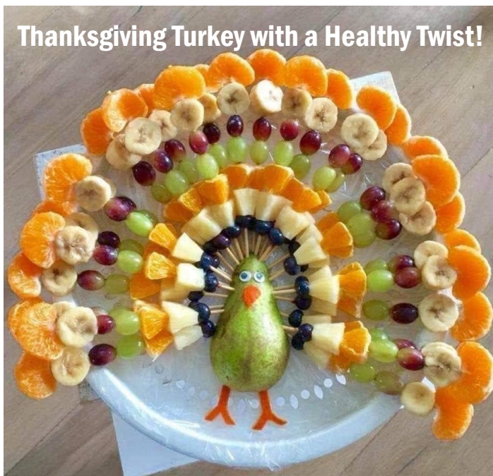
Thanksgiving Turkey with a Healthy Twist!

The Newsheet (permit 445-550) is published weekly by Waverly Road Presbyterian Church, 1415 Waverly Rd., Kingsport TN 37664-2520. Periodicals postage paid at Kingsport TN. Postmaster: send address changes to The Newsheet, 1415 Waverly Rd., Kingsport TN 37664-2520.