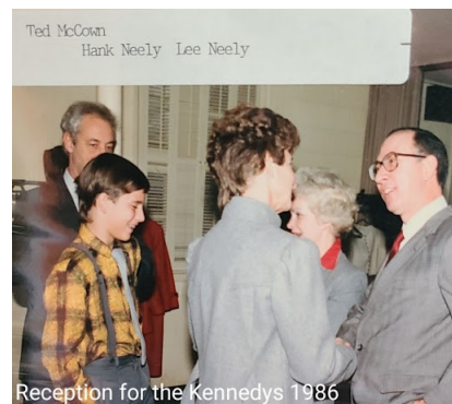
Photo: Reception for the Kennedys in 1986