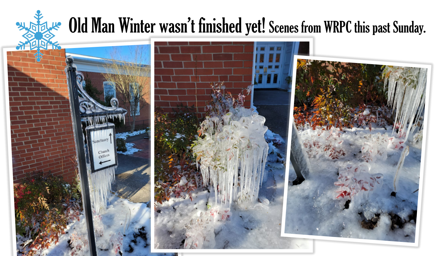
Welcome to Springtime in Northeast Tennessee!

The Newsheet (permit 445-550) is published weekly by Waverly Road Presbyterian Church, 1415 Waverly Rd., Kingsport TN 37664-2520. Periodicals postage paid at Kingsport TN. Postmaster: send address changes to The Newsheet, 1415 Waverly Rd., Kingsport TN 37664-2520.